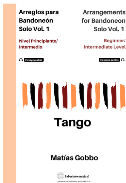
Arreglos para Bandoneón Solo Vol. 1 Arrangements for Bandoneon Solo Vol. 1