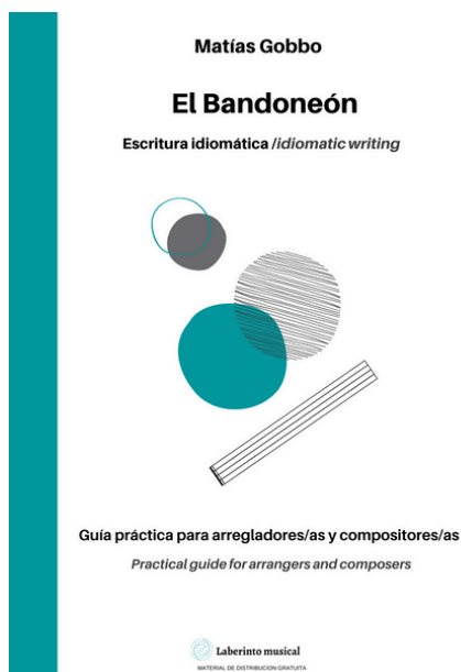
Bandoneón "Escritura Idiomática" Bandoneon "Idiomatic Writing"