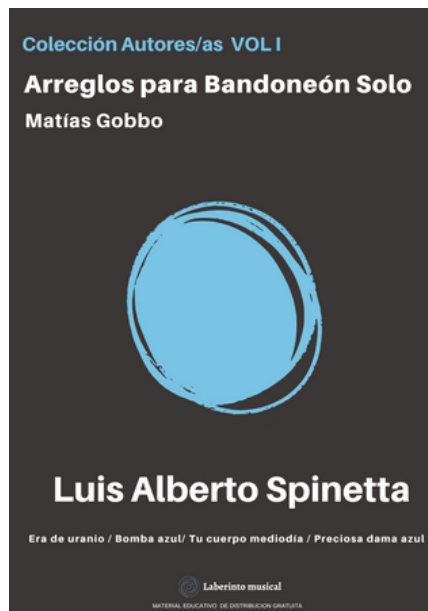
Coleccion Autores/as Vol. 1 - L. A. Spinetta Authors Collection Vol. 1 - L. A. Spinetta