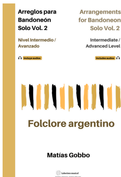
Arreglos para Bandoneón Solo Vol. 2 Arrangements for Bandoneon Solo Vol. 2